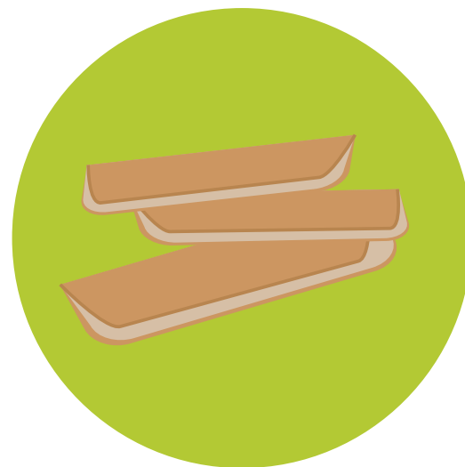
PAPER CONTAINER BOTTOMS