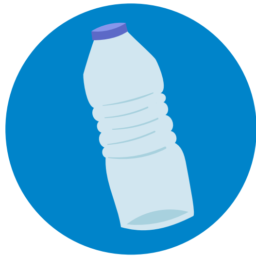
EMPTY BEVERAGE CONTAINERS