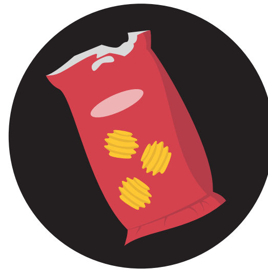
WRAPPERS AND SNACK BAGS